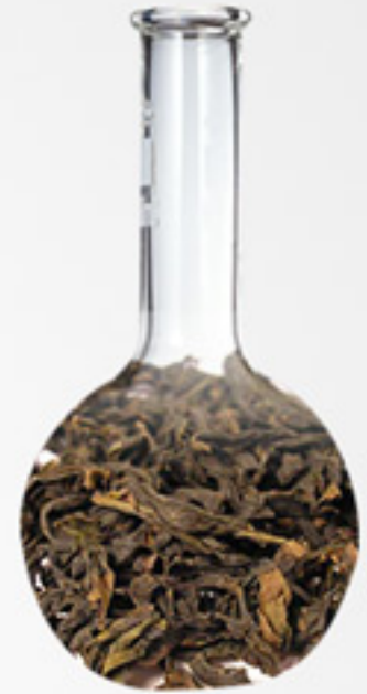
Xylinum Black Tea Ferment