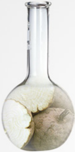
Pueraria Mirifica Root Extract